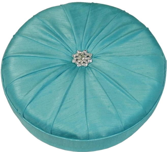
Shown in Tiffany Blue Shantung fabric with “Starburst” Bling and tufted lid at additional cost