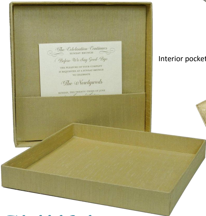
Interior pocket in lid