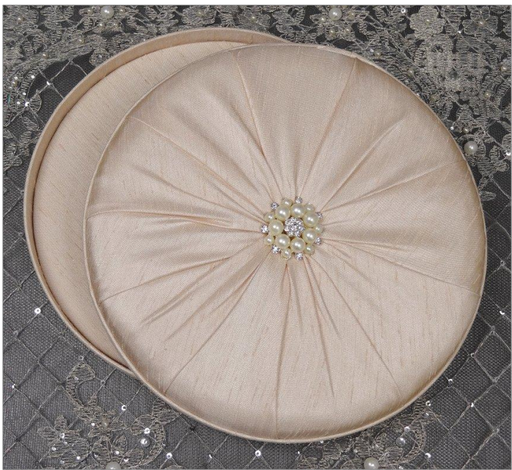
Shown in Blush Shantung fabric with “Pearl & Rhinestone” Bling and tufted lid at additional cost