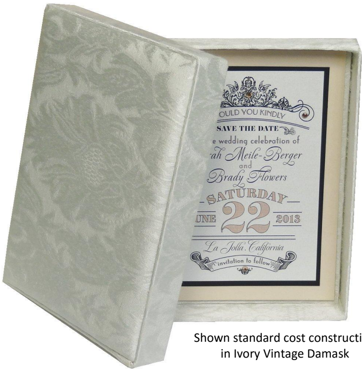
Shown standard cost construction in Ivory Vintage Damask