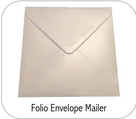
Folio Envelope Mailer