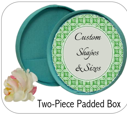
Two-Piece Padded Box