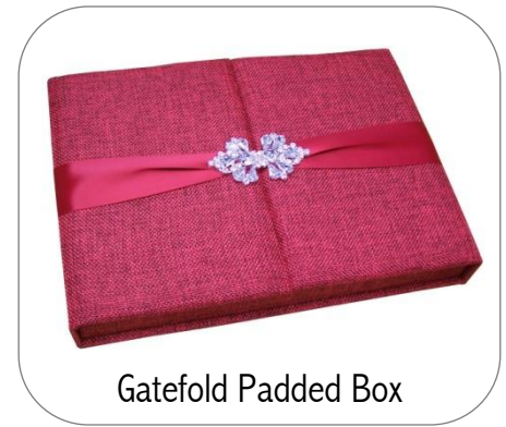
Gatefold Padded Box

Standard pricing up to 7½ x 9½ x 1. One pocket included. Custom sizes, fabrics, ribbons and trims available. See Fabrics & Bling for selection, or provide your own.