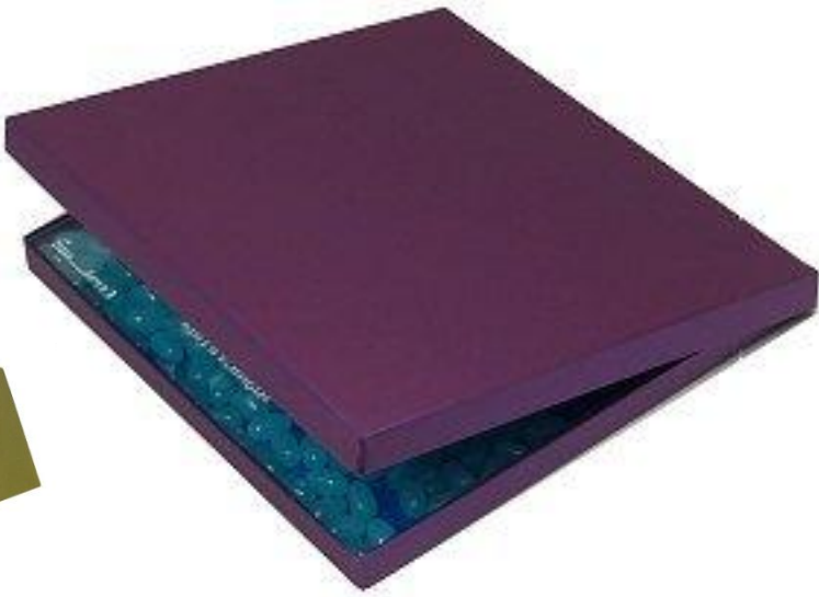
Precision depth and hinged for vertical or horizontal orientation