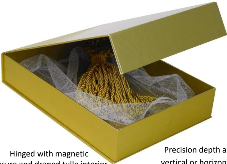
Hinged with magnetic closure and draped tulle interior